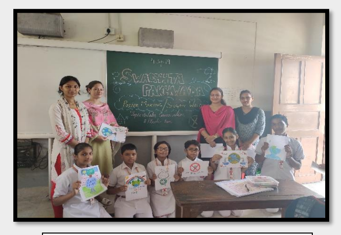
Students with their posters along with the Interns of ARMY INSTITUTE OF EDUCATION

Students of class VI-A making poster on the topics "WATER CONSERVATION" and "BAN ON PLASTICS"